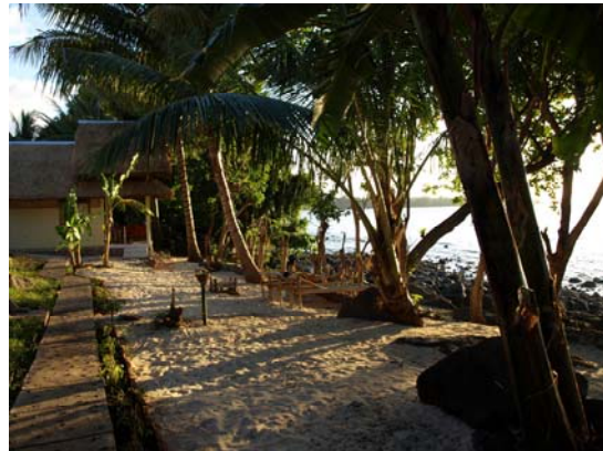
view to the beach