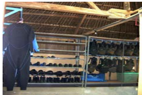
The dive shop